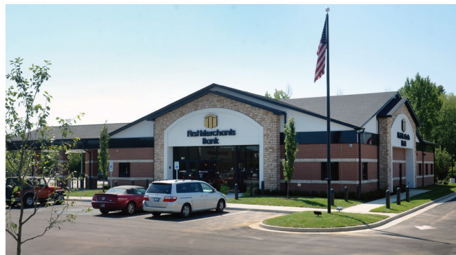
Pictured above: Greenwood Banking Center; Greenwood, IN

Over time, as these customers visit their FMB banking center or see their bankers out in the community, true relationships are built. They celebrate their team's wins and analyze the games that got away. They refer family members and friends. They may even follow their banker as he or she is promoted or moves to a